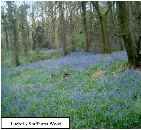
Bluebells Staffhurst Wood