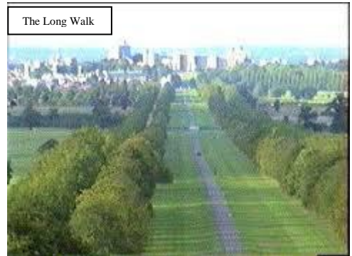
The Long Walk

The day grew warmer and warmer and Windsor Castle rose like a mirage in the distance and seemed never to get closer. But of course it did and eventually we were there. Those of us who had taken a packed lunch refreshed ourselves whilst others went off to one of the many hostelrys in the town with directions to meet in the coach park later.